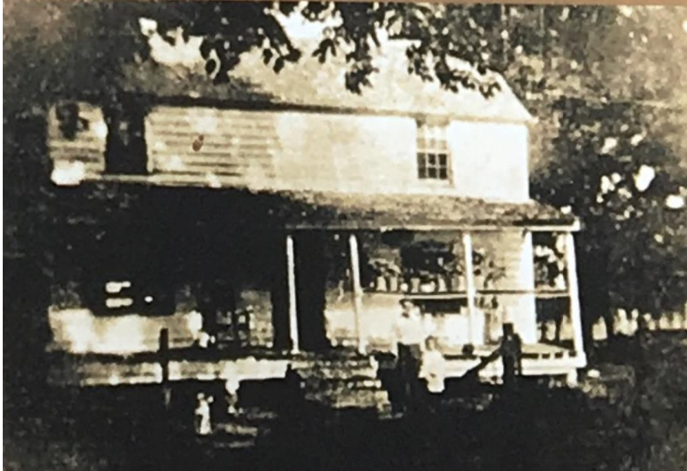
Historic Photograph of Oyster Union Society Hall with porch.