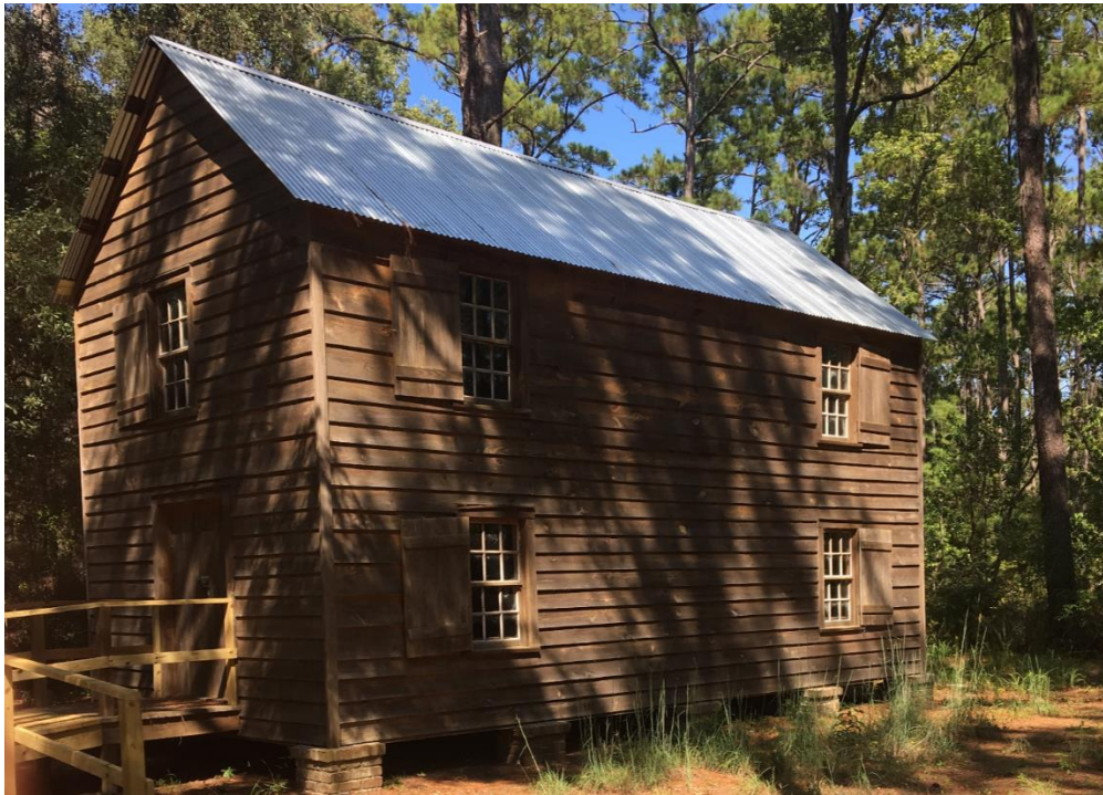
Structure after 2012 restoration.