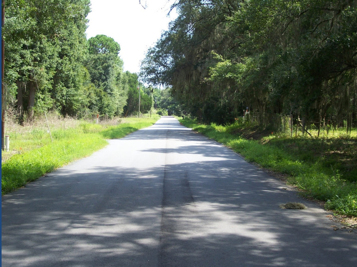
Paved County Dirt Road