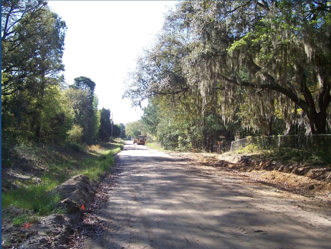
County Dirt Road Before Construction