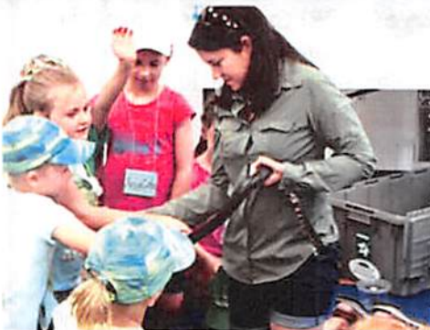
Lowcountry Institute brought snakes and other critters to Eco Camp.

Lowcountry RC & D Grants: This past year Beaufort SWCD received a RC& D Youth grant to purchase binoculars for students and print more copies of our Cypress Wetlands Activity Book for elementary to middle school students. Binoculars can be used in many settings and we don't have to ask students to borrow from their parents. See Eco campers above on a hike to the Cypress Wetlands.