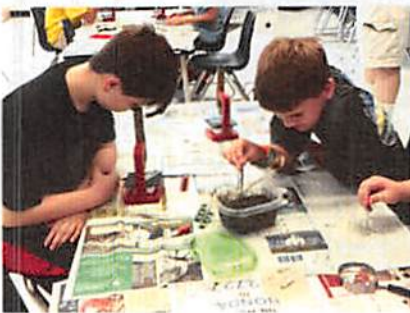
Looking at pond scum at Eco Camp.

Education: This past year Beaufort SWCD presented 251 classroom & festival outreach programs reaching over 6500 students and adults.