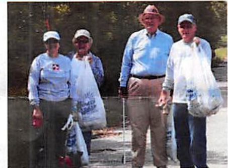
Friends of Hunting Island Volunteers participating in Beach Sweep.

Our Conservation Partnership Services are Available to All Citizens of Beaufort County