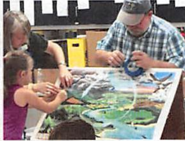
Campers learn that water doesn't always move in a circle.